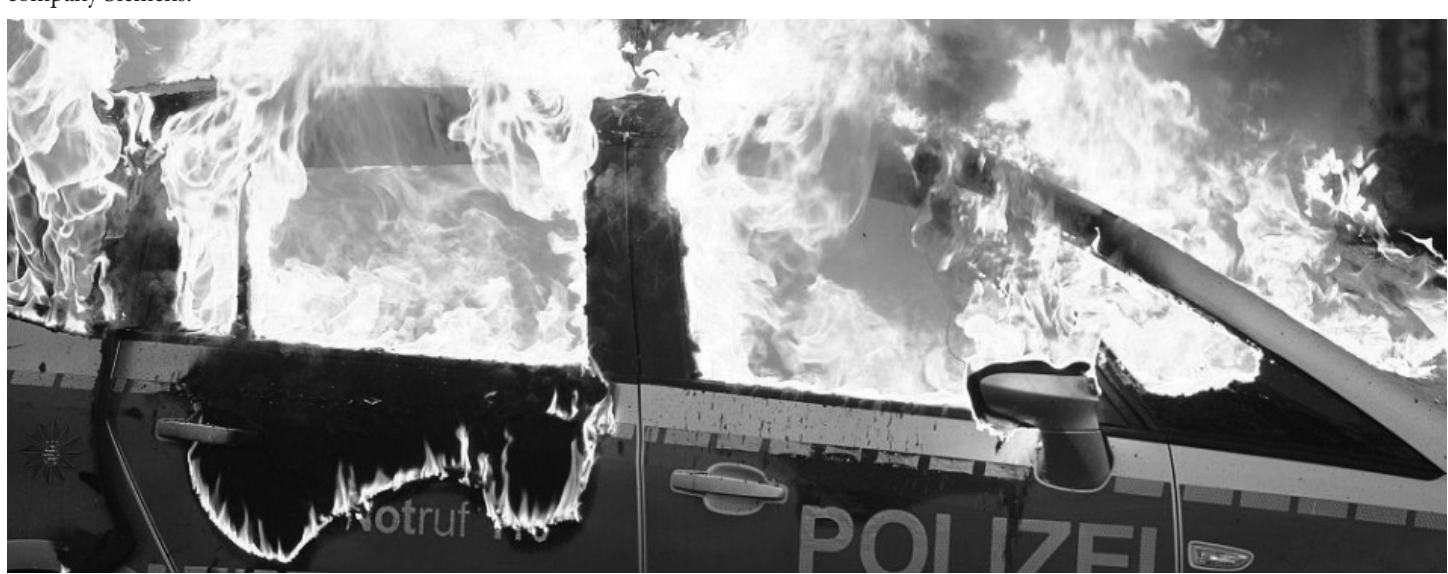
Burning cop car in Frankfurt, Germany.