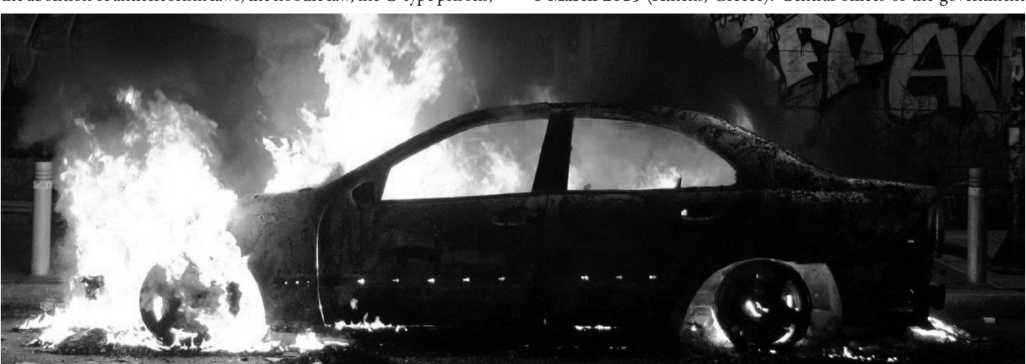
Car burning during solidarity demonstration March 17th in Athens.

8 March 2015 (Athens, Greece): Central offices of the government