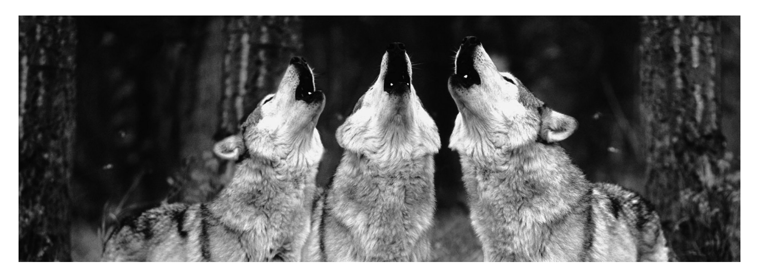
"We are an image from the future." - graffiti in Greece, 2008

Rebellion has ruptured the placid suffering of yesterday.